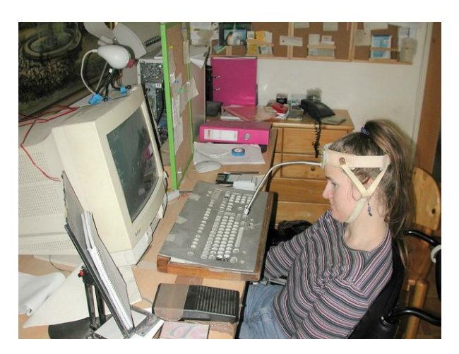
Figure 3: Viennese non-speaking head stick using person working with an RT system called AUTONOMY [3] which is remotely supported via RESORT

H.323 specification and desktop/application sharing according to ITU T.120. The user interface of the RE-SORT controller can be tailored according to the needs of the users. The RCI (Remote Control Interface) and the RESORT protocol allow synchronisation in real time. This is possible as only small data messages are transferred instead of changed screen contents. This method dramatically reduces the required bandwidth [2] and enables the RESORT system to provide real time monitoring of single switch users.