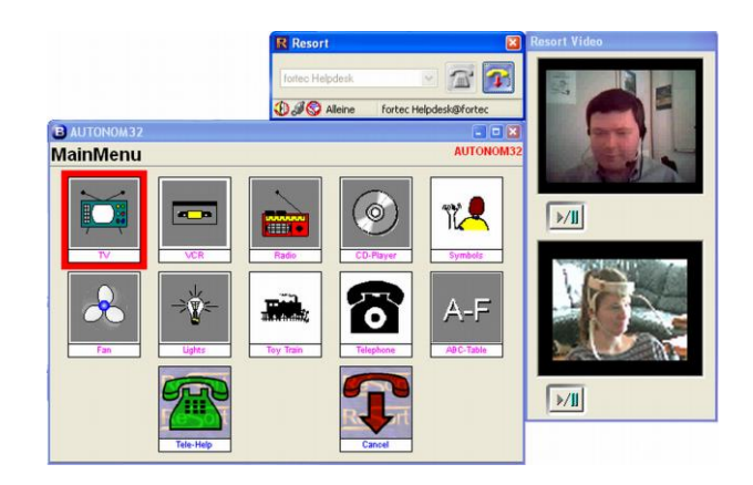
Figure 2: RESORT Client during a Tele-Service session

The RESORT system exploits existing technologies for tasks like video / audio transmission according to