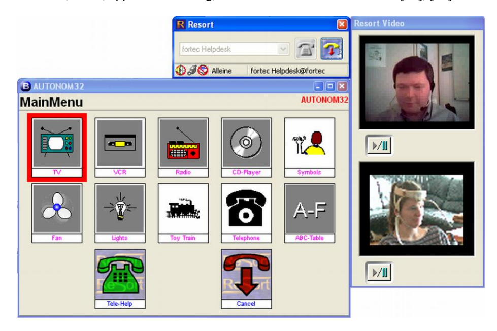
Fig. 2. Screen Shot from a RESORT Client during a Tele-Service session in Vienna. A nonspeaking head stick using person runs an environmental control and communication system called AUTONOMY [31], [35] which is equipped with a RESORT Interface. The service centre can be called from inside the AUTONOMY system

network interface to the remote RC. IP serves as network protocol. The RESORT system is a highly modular system which allows to exchange specific parts without the need of adapting other parts. This increases the independence from 3rd party products for audio, video, application sharing, etc. More details can be found in [14], [32].